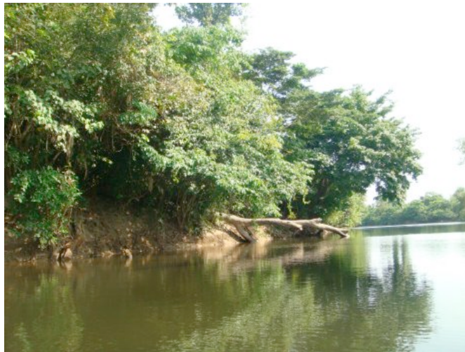
The Po River in Montserrado County

*All information provided by the Travel and Investors Guide to Liberia has been put together with the utmost care, and fact checking. However, we assume no liability for the accuracy of the information provided.*